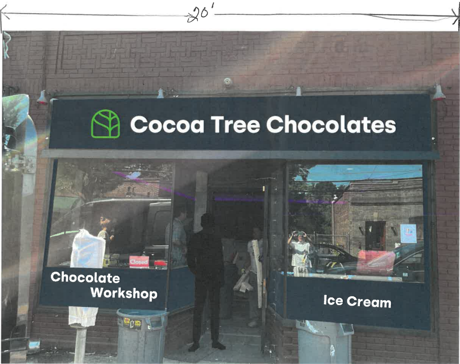
1 Store Front

This custom design is the exclusive property of SignDesign & J.C. Awning. All rights to its use and reproduction are reserved.