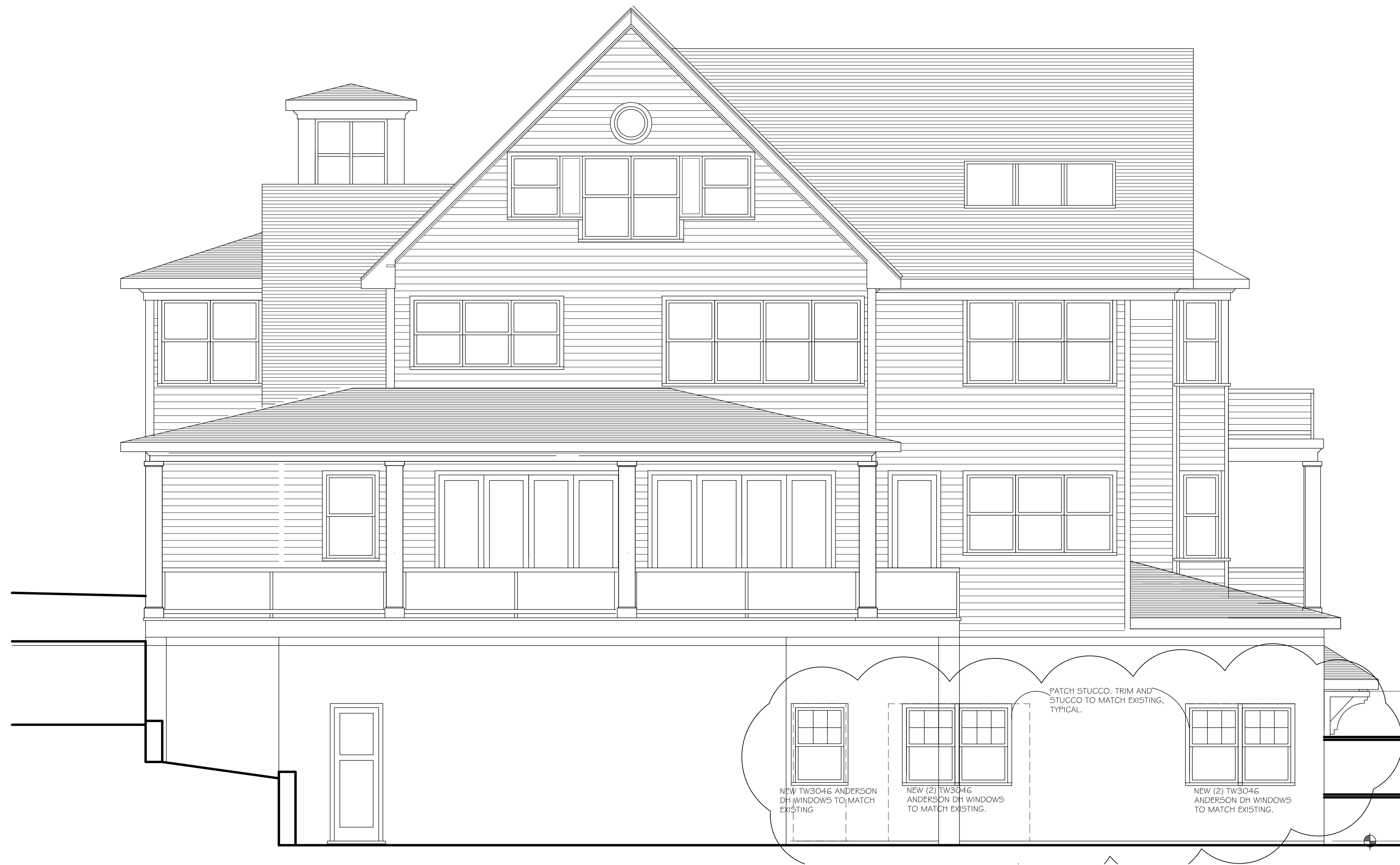
NORTH EAST (REAR) ELEVATION SCALE 1/4": 1'-0"