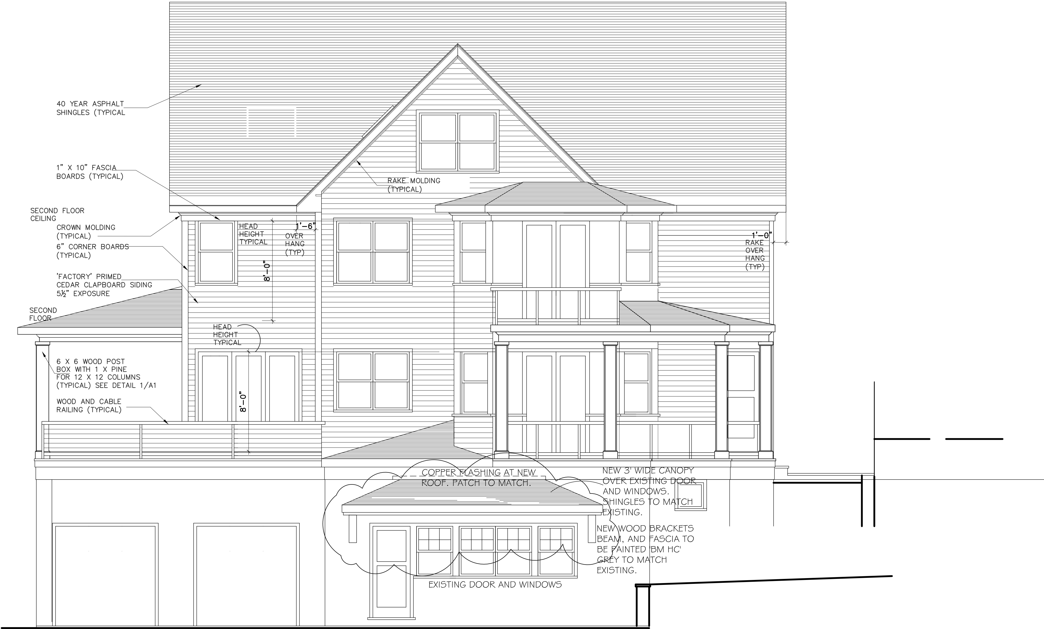
NORTH EAST (REAR) ELEVATION SCALE 1/4": 1'-0"