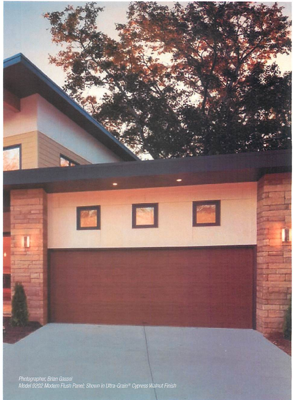
Model 9202 Modern Flush Panel; Shown in Ultra-Grain® Cypress Walnut Finish