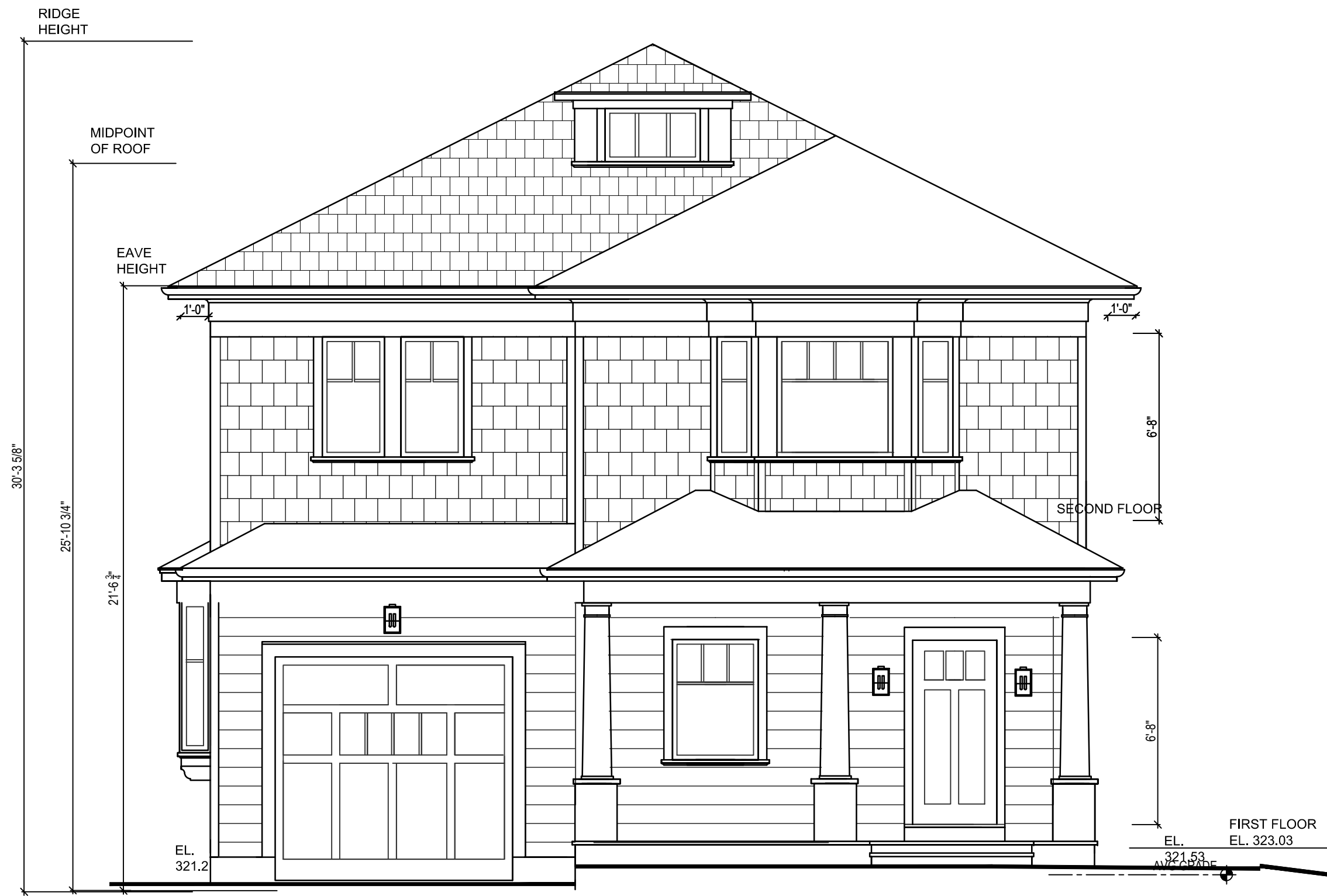
LOT 2 NORTH ELEVATION SCALE: 1/4" = 1'-0"