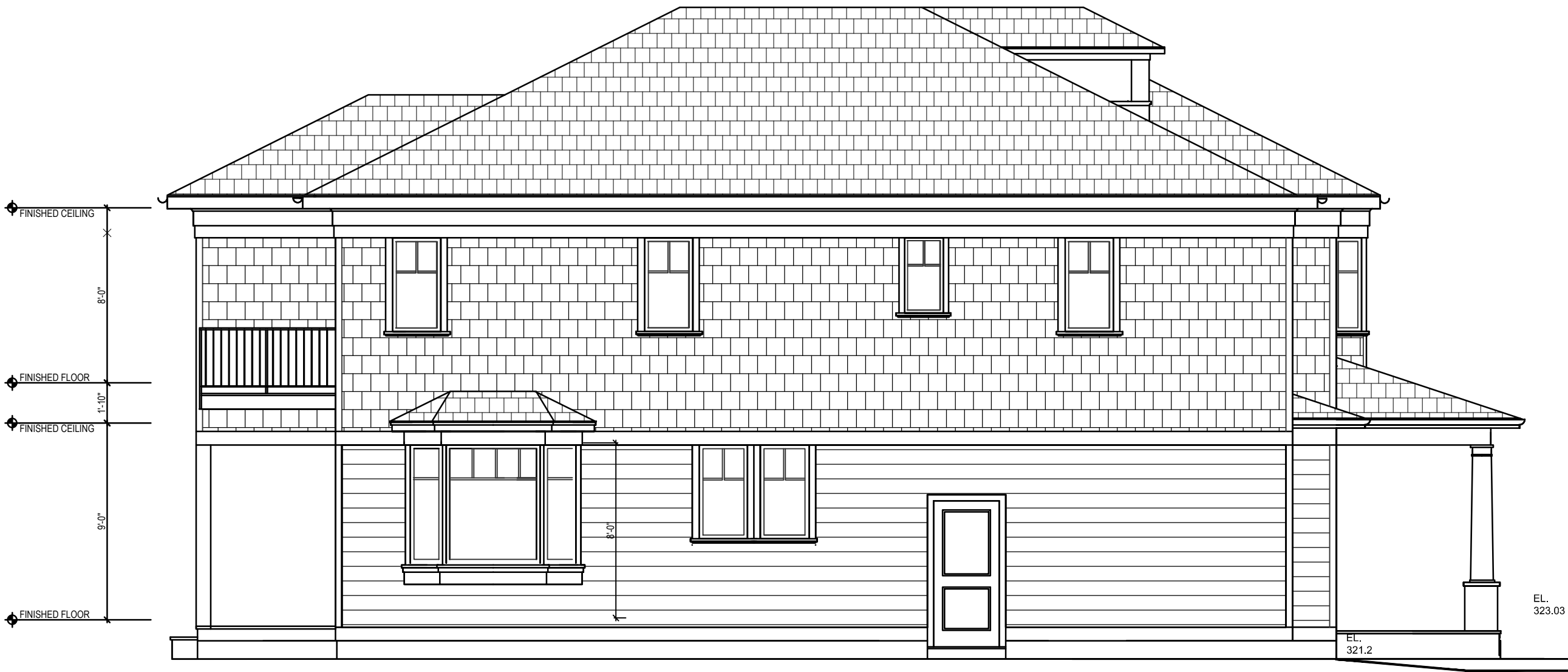
LOT 2 EAST ELEVATION SCALE: 1/4" = 1'-0"