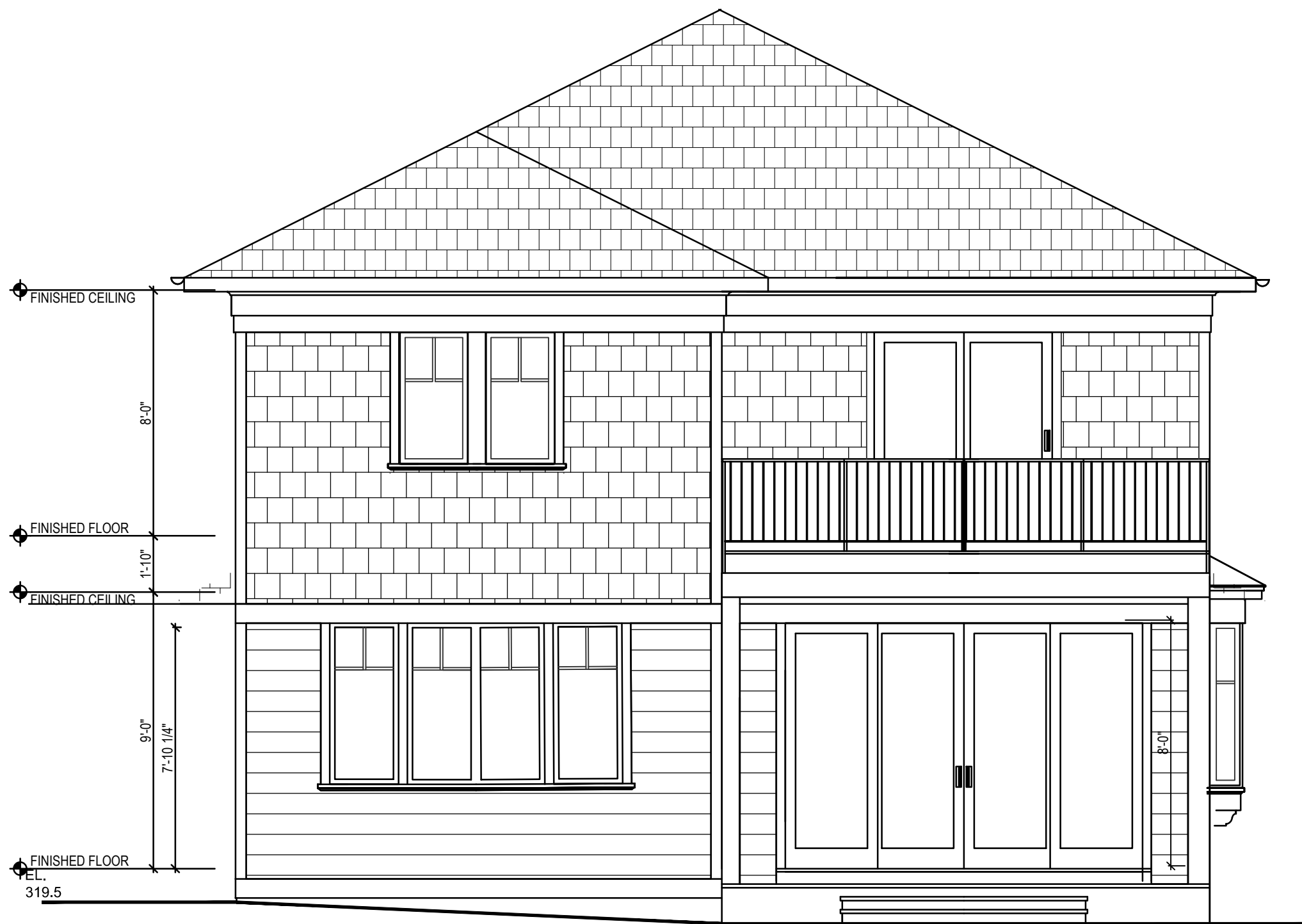
LOT 2 SOUTH ELEVATION SCALE: 1/4" = 1'-0"