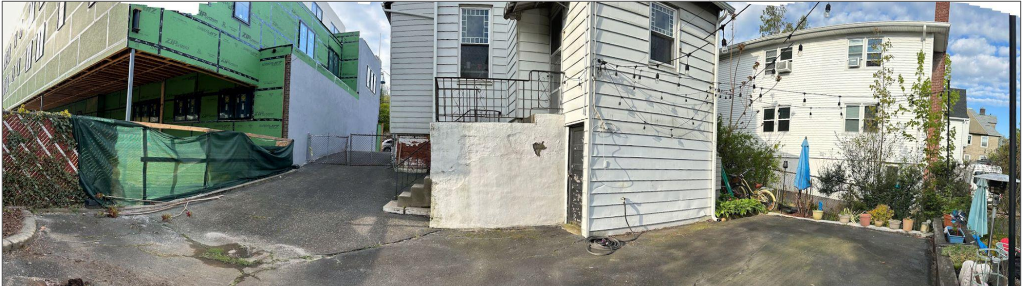
Panorama showing neighboring properties