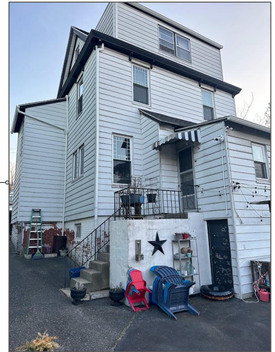
View from rear yard of proposed deck location