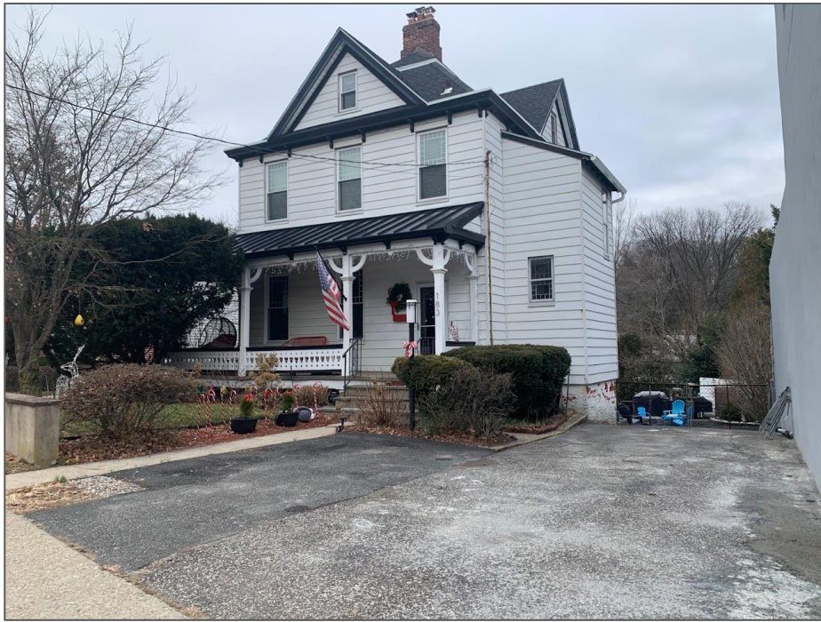
View from street/driveway; Note: no view of proposed deck from front.