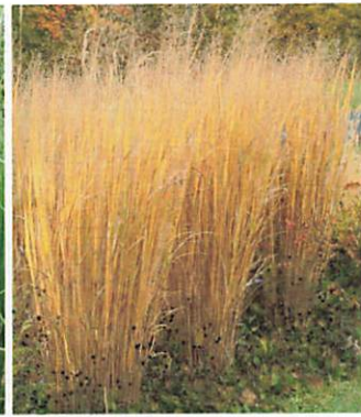
Panicum virgatum 'Northwind'