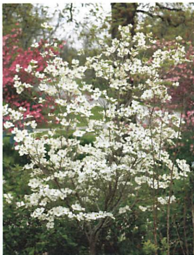
Cornus florida 'Cloud Nine'