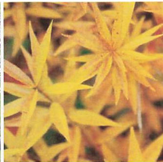
fall foliage color