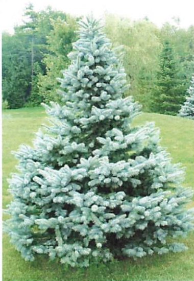
Picea pungens 'Baby Blue Eyes'