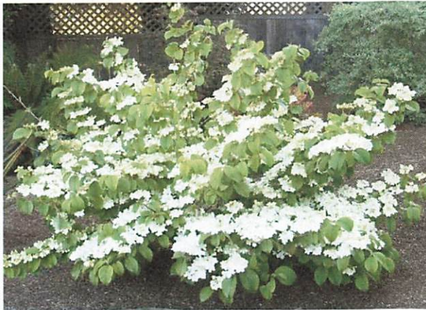
Viburnum plicatum 'Mariesii'