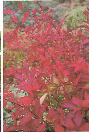
Acer palmatum 'Bloodgood'