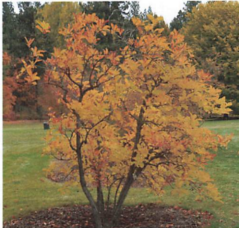
Chionanthus fall foliage