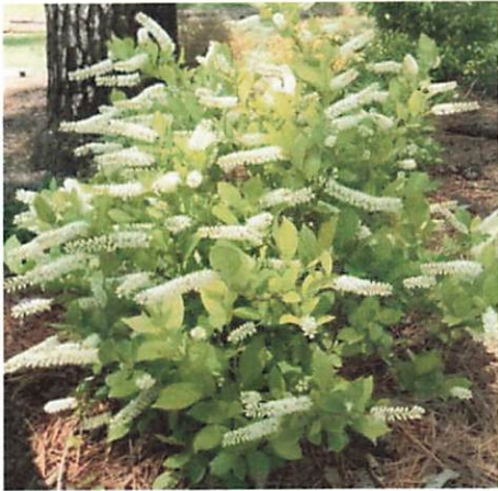
Itea virginica 'Merlot'

Become a Co-author with Nature; Write the next chapter for your landscape