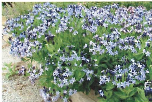
Amsonia X 'Blue Ice'