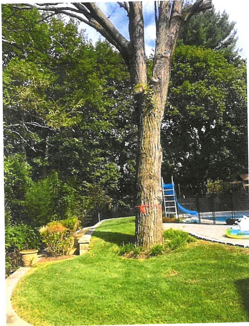
MACIAS - 193 CLINTON AVE 34" DIAMETER SUGAR MAPLE