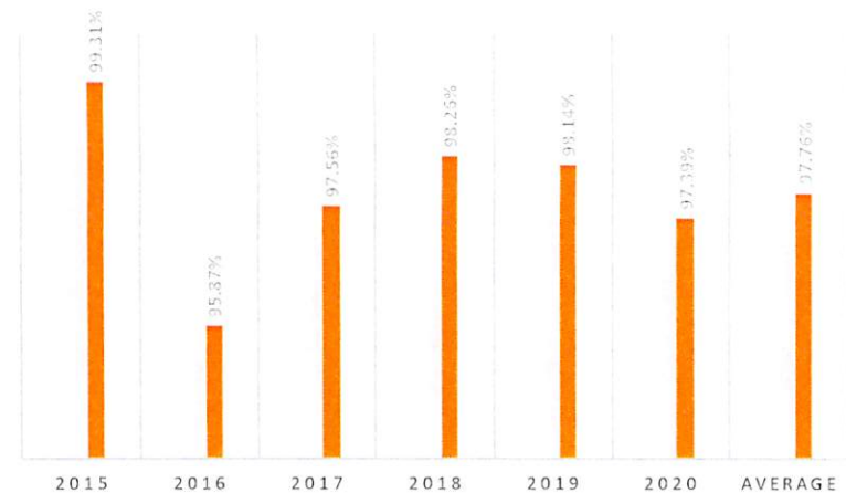
PROPERTY TAX COLLECTIONS THROUGH SEPTEMBER