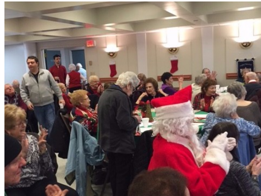
Senior's Annual Holiday Christmas Luncheon at Village Hall Firehouse - December 2016

...to the committed Library Staff who provide such a great learning resource to the community ... to the members of American Legion Post 1048 and Auxiliary and all the Veterans who have served our nation and who we are so proud ... to those who serve on Village Committees and Review Boards , giving their time to help the village make good decisions and contemplate new ideas ... to all the School Administrators and Teachers and BOE members doing an