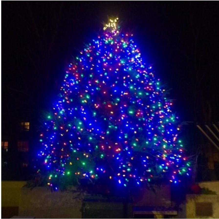
Beautiful Dobbs Ferry Holiday Christmas Tree

On behalf of the Board of Trustees and the entire Village, We want to take this time to wish Everyone a